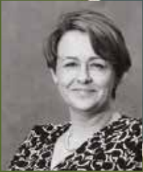
Baroness Tanni Grey-Thompson Dbe, DI